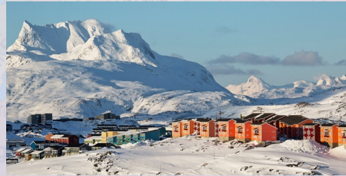
Nuuk is the capital city of Greenland.