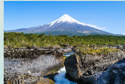
The Osorno volcano is in the Andes mountain range.