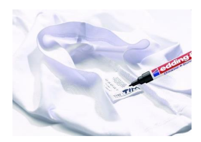
Please write names in clothes